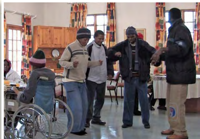
Hospice patients dancing with joy.

After many weeks of special care and the help of medication, he literally danced out of our hospice. The love and care that you help us provide did wonders for this young man, and with his health back under his control all that was left for us to do was find his family. We organised his long journey home, provided