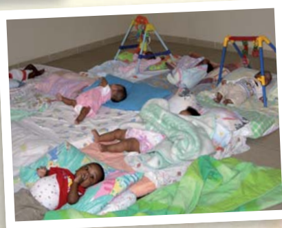
Daily nap time for our littlies.