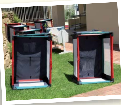
'Washday' for our baby cots – drying out in the summer sunshine.