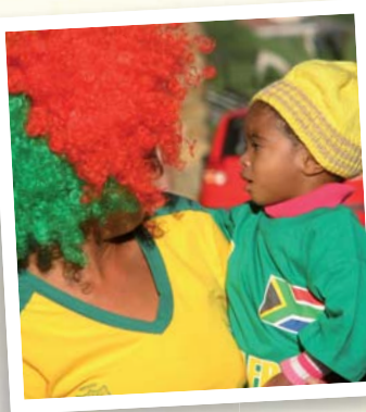
It's long over now, but our children didn't miss out on all the excitement and festivity of the 2010 Soccer World Cup.